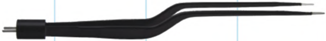
Gerald Bayonet 08-021-10 NS L=17.8 cm Tip Size=1.0 mm