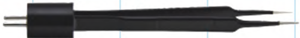
McPherson (Crv.) 08-002-05 NS L=9.0 cm Tip Size=0.5 mm