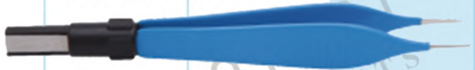
Adson 101-006-10 L=12.1 cm tip size: 1.0 mm