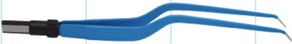
Bayonet (Ang.Up) 101-058-10 L=18.0 cm tip size: 1.0 mm