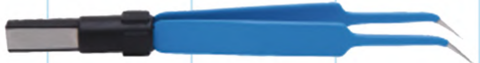
Jeweler # 5 101-003-05 L= 11.5 cm tip size: 0.5 mm