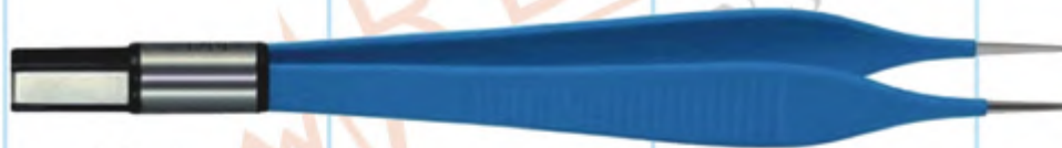
Adson 10-006-10 L=12.1 cm tip size: 1.0 mm