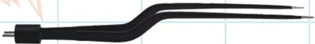
Yasargil 08-022-10 NS L=19.8 cm Tip Size: 1.0 mm