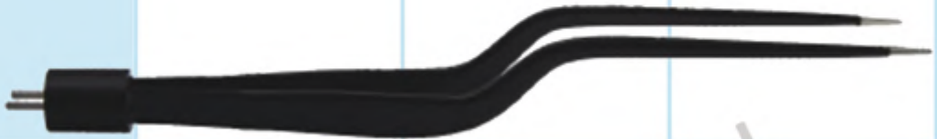
Jansen Bayonet 08-028-10 NS L=18.0 cm Tip Size=1.0 mm