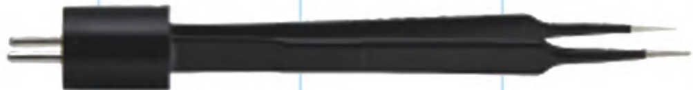
McPherson (Str.) 08-001-05 NS L= 9.0 cm Tip Size= 0.5 mm