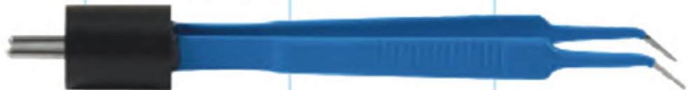
McPherson (Crv.) 08-002-05 L=9.0 cm Tip Size=0.5 mm