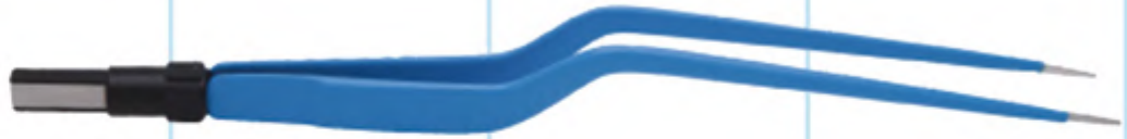
Bayonet 101-040-10 L=20.0 cm tip size: 1.0 mm